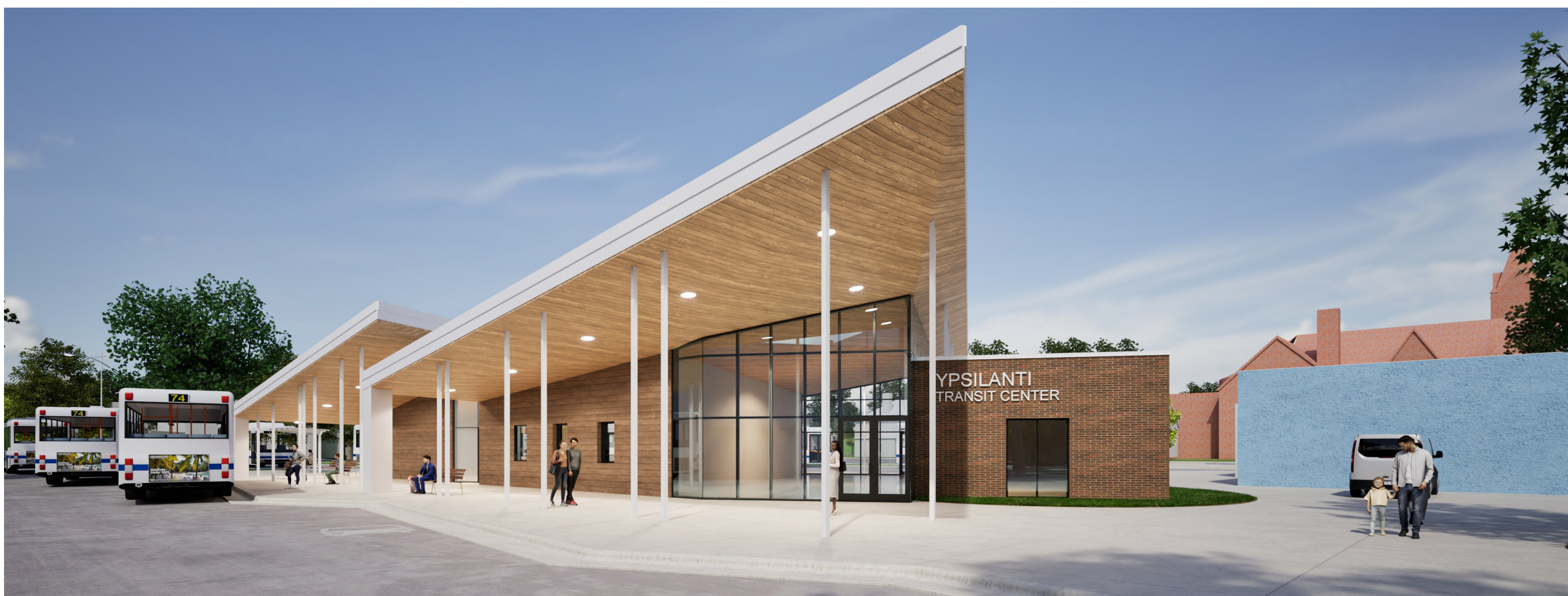
View of the front entrance at the corner of Pearl and Washington Streets.