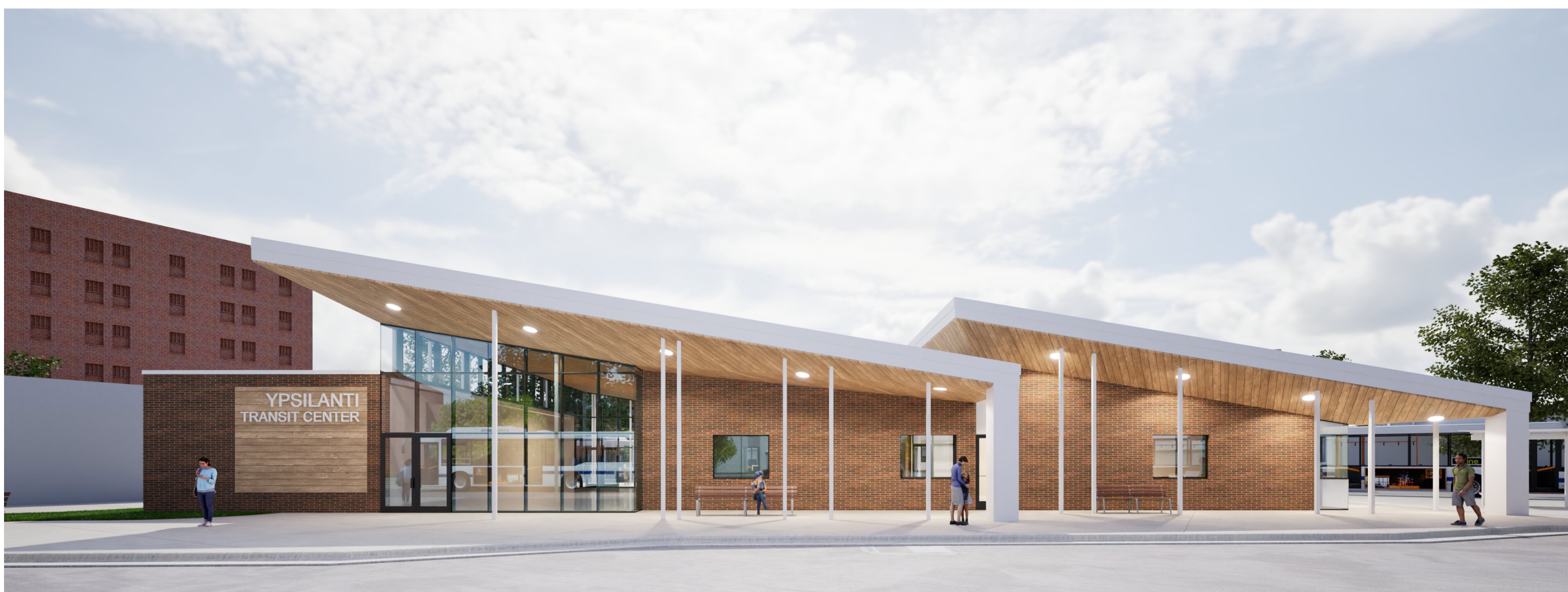
View of the rear entrance looking from the bus drive aisle.

All plans and designs are subject to change as the design process continues.