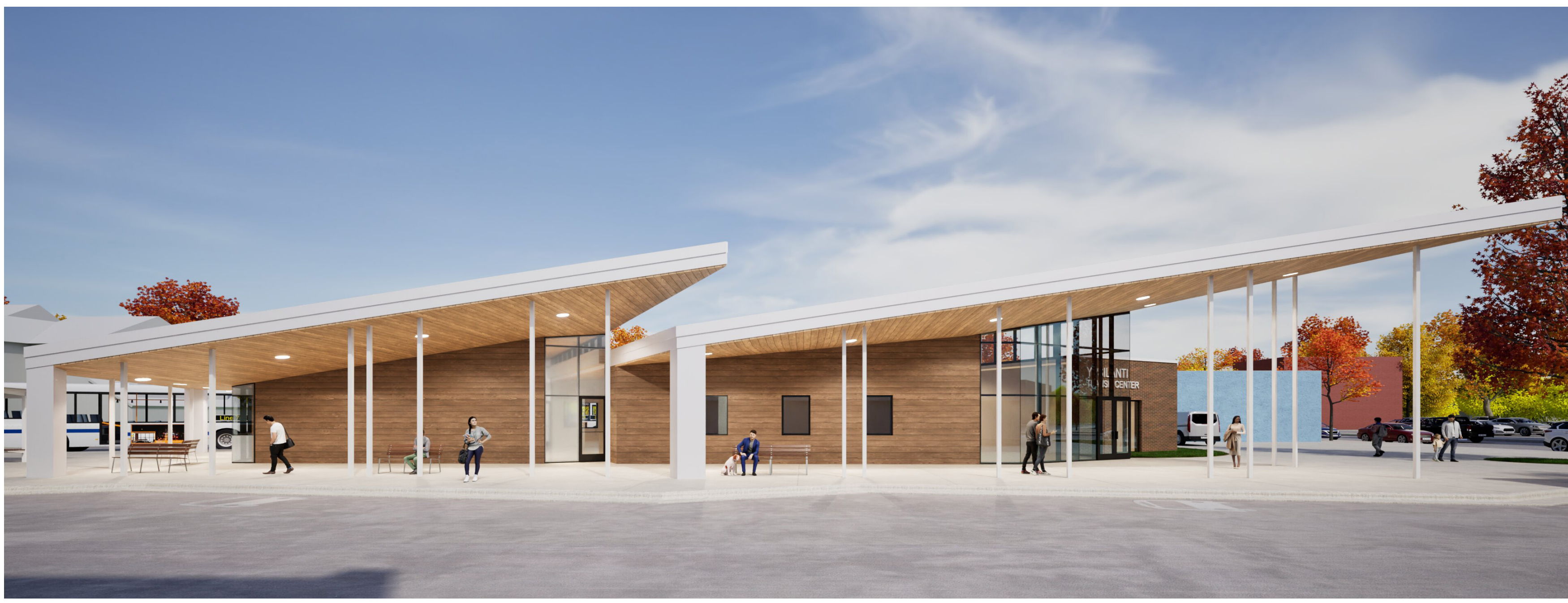
View of the front of the proposed YTC from Pearl Street.

The following preliminary designs were created to support the solicitation of feedback from the public and stakeholders at an early stage. The facility will be approximately 6,700 sq.ft., which is over three times larger than the existing YTC. The facility will be on one floor, will preserve surrounding commercial and historic structures, and have a modern distinct design that fits with the character of nearby development.